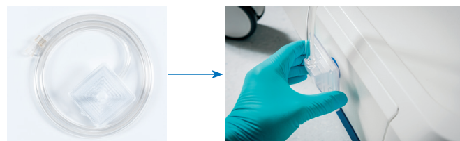
CATSmart vacuum line with integrated Hydrophobic filter